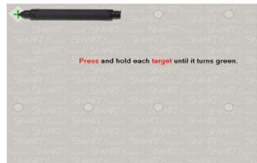
The calibration screen