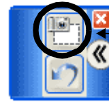
Floating Tools Toolbar

NOTE: If the Floating Tools toolbar does not appear when you pick up a pen, you may be working in an Ink Aware application (e.g., Microsoft Word). If the application is Ink Aware, these buttons will be available in the application's own toolbar.