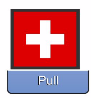
A ready-made pull tab from the Lesson Activity Toolkit 2.0.