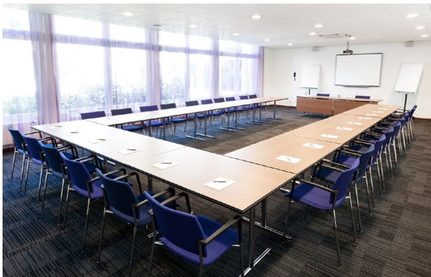
16 rooms at the Kaap Doorn Conference Centre are equipped with SMART Board® interactive whiteboards.

Kaap Doorn is truly a specialist in arranging business meetings - whether a course, training, seminar, company presentation or other type of business meeting. The Conference Centre has 23 meeting rooms and 16 of their largest meeting spaces are equipped with SMART Board® interactive whiteboards at no additional charge to the customers.