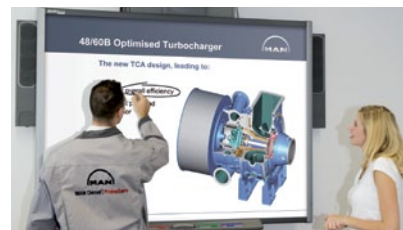
SMART Podium™ interactive pen display makes a convenient solution.

"SMART has convinced us with its overall package. Its flexible solutions, the easy-to-use, the many various applications and especially the service are unbeatable!"