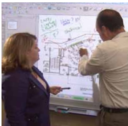
SMART Board interactive whiteboards are used to plan and review SCAN Health Plan's office space

"We wanted to break down silos, we wanted to have an 'adhocracy' rather than a hierarchy, we wanted staff to collaborate more – and the SMART Boards really help us do that."