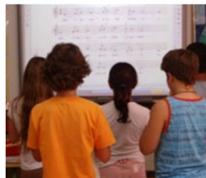
A group of students perform music exercises on a SMART Board® interactive whiteboard.

The successful implementation of technology in the school is an exemplary example of the changes occurring in education. Digital, interactive content is now part of every day school life and is embraced by teachers and students at Comunitat Valenciana.