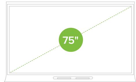
SMART Board 6075