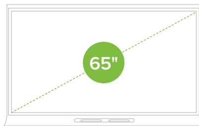
SMART Board 6065