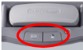
Pen Tray Buttons