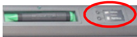
Pen Tray Buttons