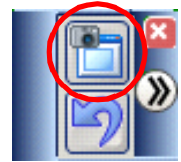
Floating Tools Toolbar