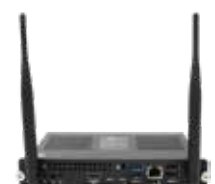
SMART OPS PC module The power of Windows® 11 Pro – no laptop needed