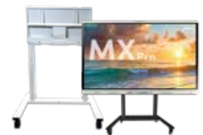
SMART mobile stands Add flexibility and mobility