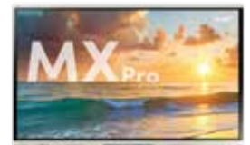
SMART Board® MX Pro series Where productivity and collaboration meet